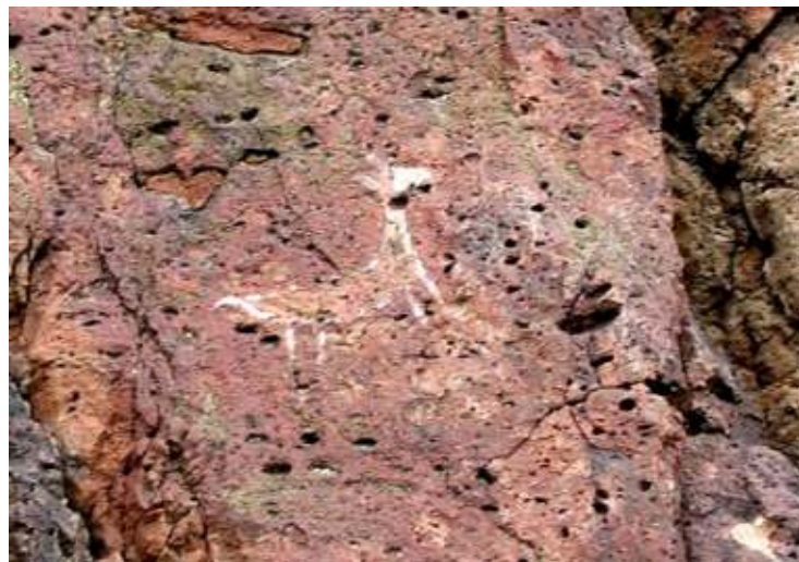
A pictograph of a horse at the old Indian "meeting place" near Council Rock, dating it after 1540 – when the Spanish brought the first horses into New Mexico.