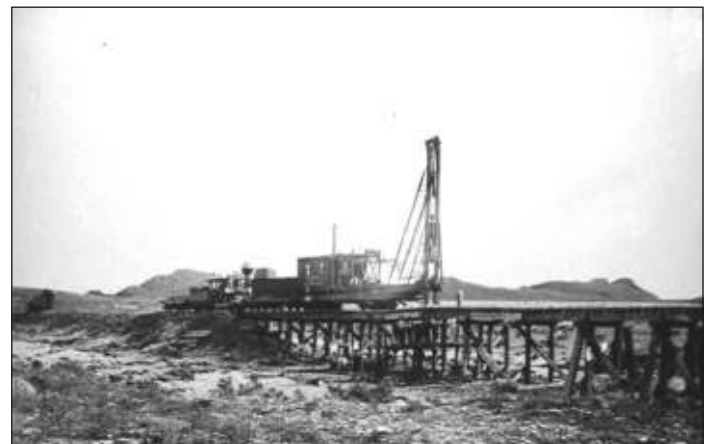
Building the Magdalena spur line. This bridge, spanning an arroyo west of the old Water Canyon station, is still visible north of U.S. 60.

During the early 1900s, new ranchers and small mining concerns caused the area to grow. A complex of homes