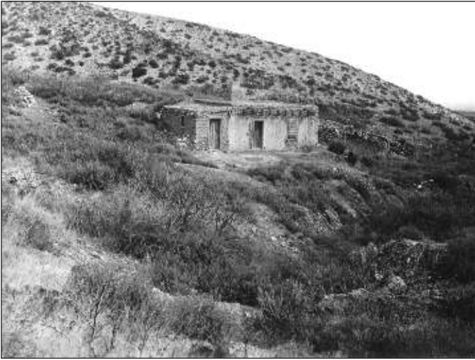
An 1890s photo of the Puertocito trading post. This was also the post office from 1903 through 1929. Puertocito was abandoned in the 1940s.