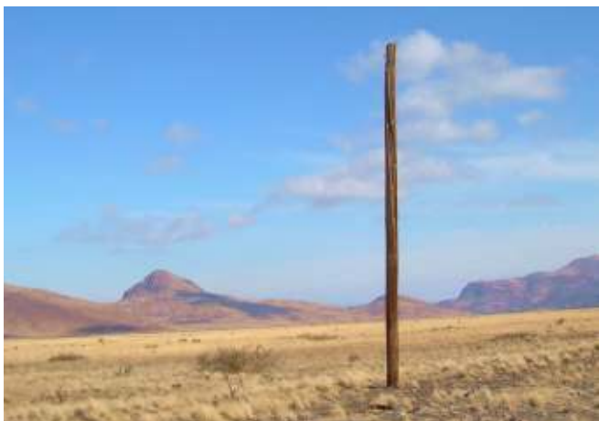
A few lonely telegraph poles still stand along the old railroad grade near Water Canyon.