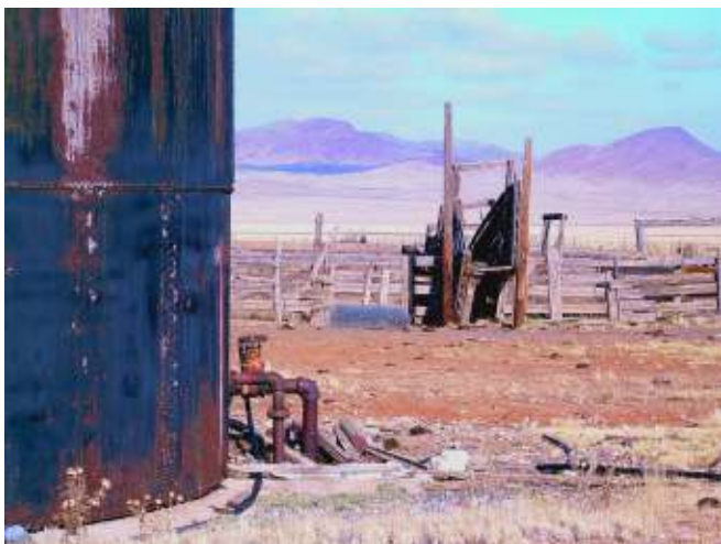
The water tank and stock pens at the AT&SF Water Canyon station. The flat swale between the tank and stock pens is the old railroad grade.