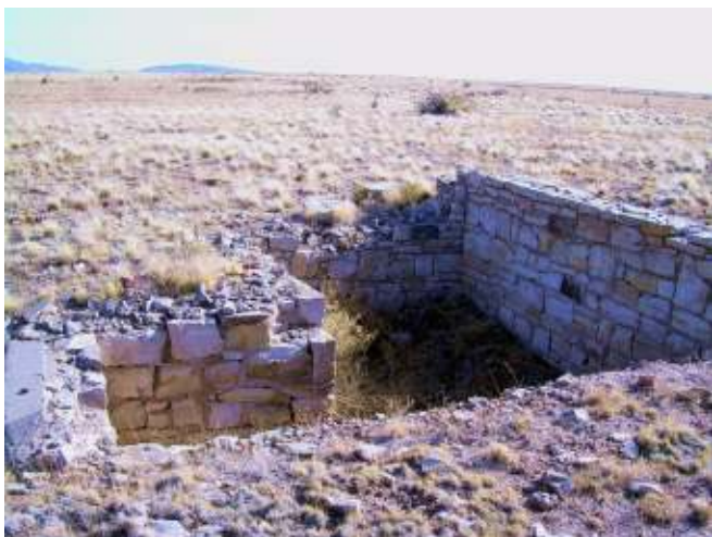
Remains of the old AT&SF station building. Likely, this was also the location of the first Post Office.