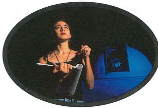
Guided Night Sky Stargazing Etscorn Observatory on New Mexico Tech Campus

The First Saturday Tour event culminates in an evening of FREE Guided Night Sky Telescope Viewing at the Etscorn Observatory on the Campus of NM Tech located in Socorro. The night time event begins at dark and lasts two hours, despite weather conditions, no reservations required.