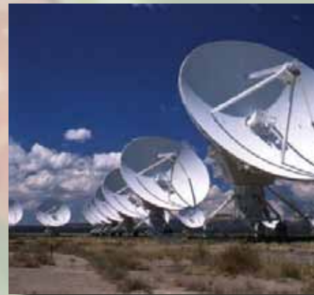
Radio telescopes use radio waves instead of light waves to make images of the sky.

in a "Y" pattern spread across the plains of San Augustin 50 miles west of Socorro. The VLA has been used by more astronomers and has been mentioned in more scientific papers than any other radio telescope in the world.