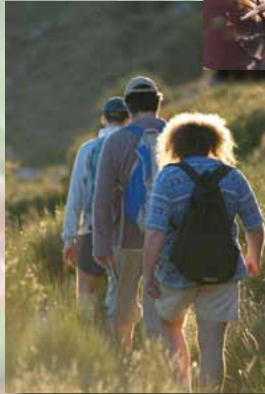
The Datil Well Campground area has 3 miles of scenic hiking trails.

A scenic and popular picnicking and camping area, this campground has 22 individual campsites as well as a group shelter for large gatherings. The group shelter and several campsites are covered for shade. All sites have picnic tables, grills and fire pits. Drinking water, firewood and restrooms are provided. An overnight camping fee is charged.