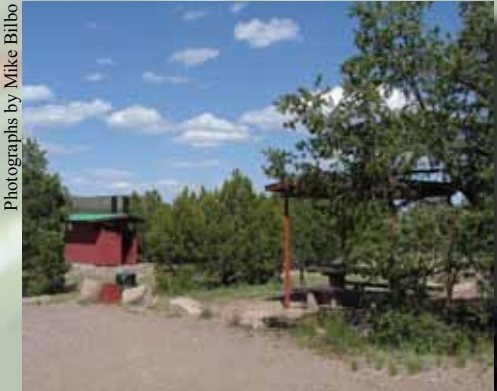
Datil Well Campground